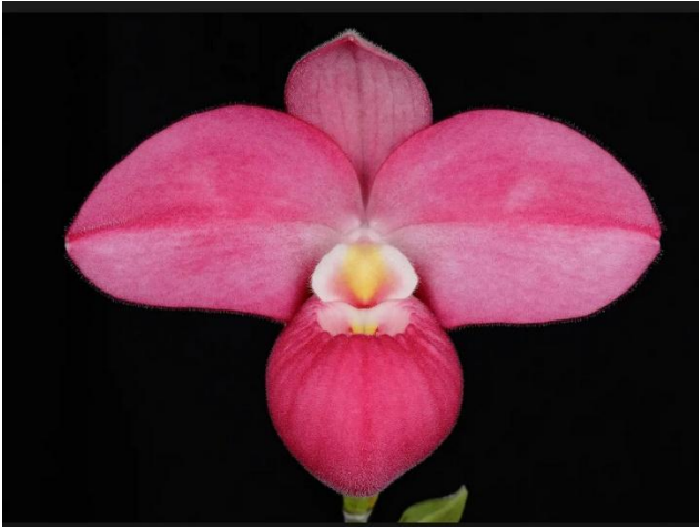
Phrag QF Kaleikaumaka 'D's Birthday' AM 84 pts (Peruflora Cirila Alca 'North Fork x fischeri) 7618