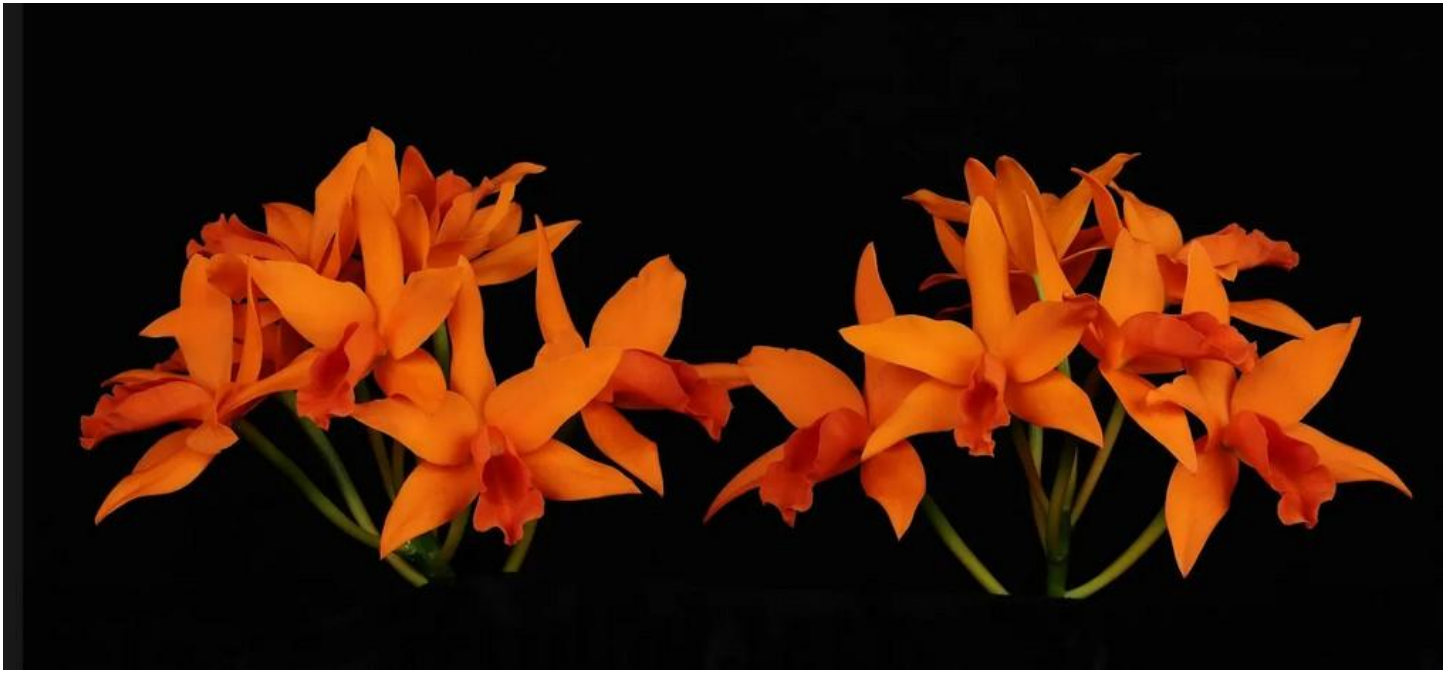
Blc (Rth) Mary Vaux Walcott 'Pi Day' Am 81 pts. (Rth Caroline Orange D'or 'Lenette #2' x Ctt Trick or Treat 'SVO'