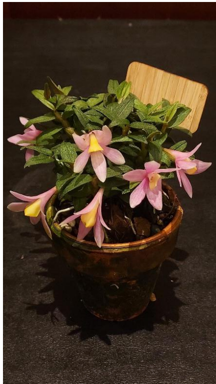
2. Den. Misty Mountain Pink