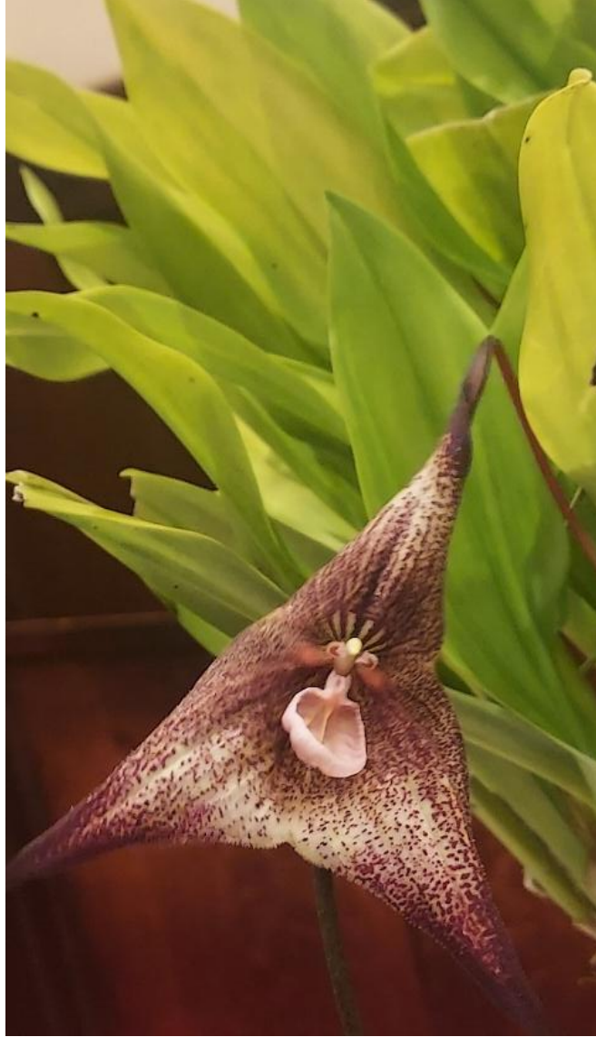
Dracula hirtzii