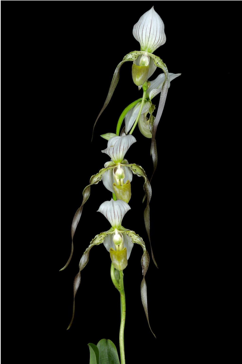
Paph. Lian Tan v. alba 'Artemis' AM (philippense v. alba 'Albino Beauty'; x dianthum v. alba 'Albino Beauty')