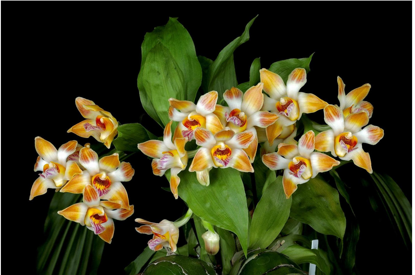
Chysis limminghei 'Jill's Day' CCM