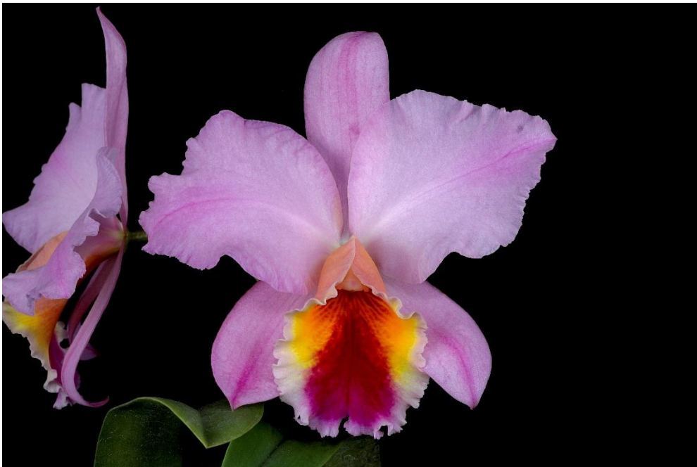
C. Walnut Valley Circle 'Around the Moon' AM (C. mossiae x Slc Circle of Life)

A list of other AOS Awards follow this article