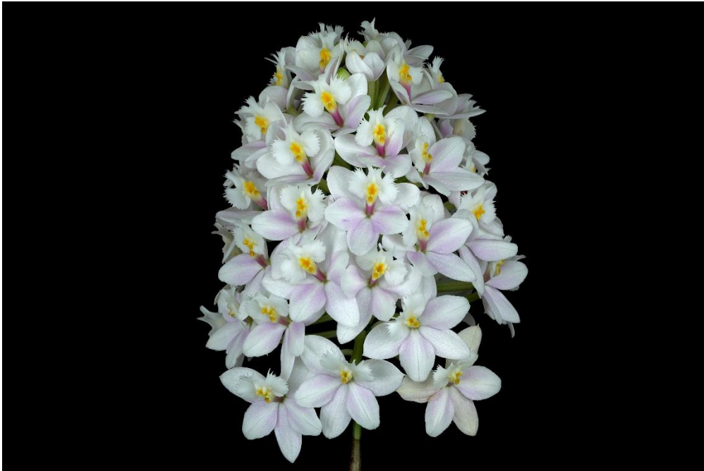
Epi Candy Valley 'Casablanca' AM (Peach Valley x Sakura Valley)