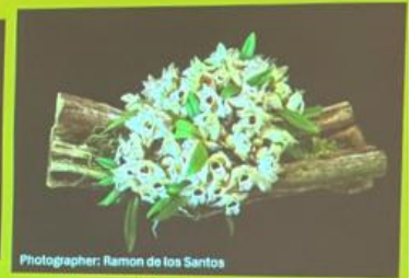
Den. victoria-reginae 'Muxen' HCC/AOS